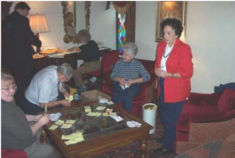
Vocation Raffle Tickets everywhere