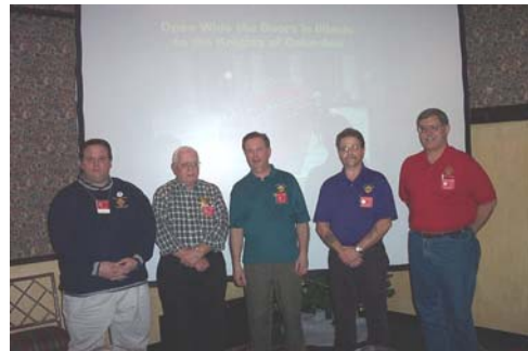
Newest Members of Swiss Guard