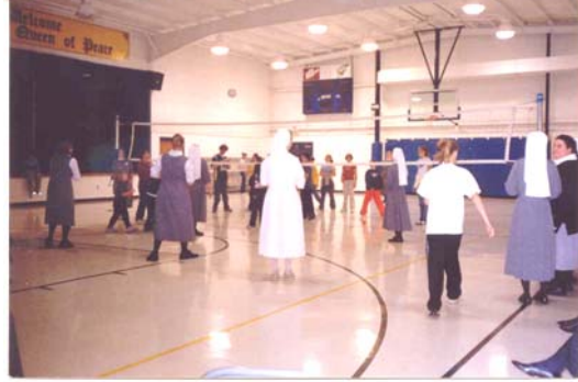
I would think that the Sisters won