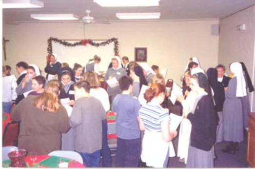
Sisters chatting with their host youth group