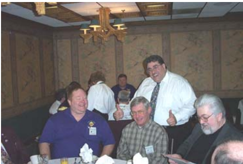
The Free Throw sites are set