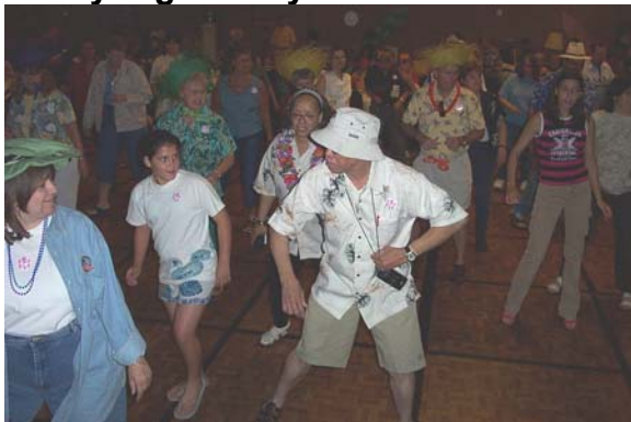
Young and a little older had a great time. It was one of the best parties we have had. Everyone stayed late and danced all night.