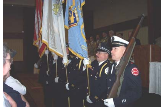
Members from St Michael The Archangel 12173 and St. Florian Patron of Firemen 12911, posted the colors at the opening ceremonies of the State Convention. What an honor for us to have them with us.