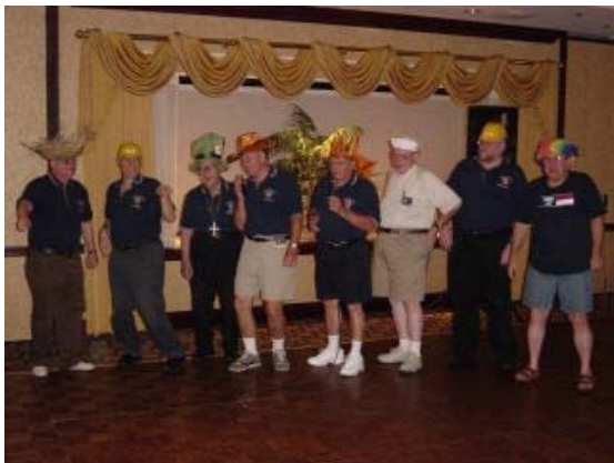
Introducing the 2004-05 State Council Village People