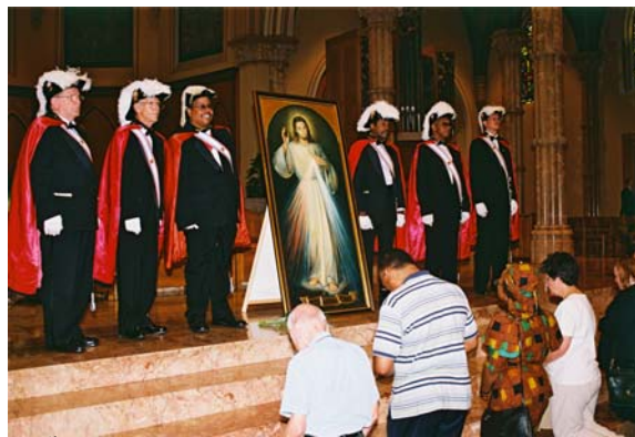
4 th degree Honor Guard stand with Icon on display at the Holy Name Cathedral in Chicago after the prayer service.