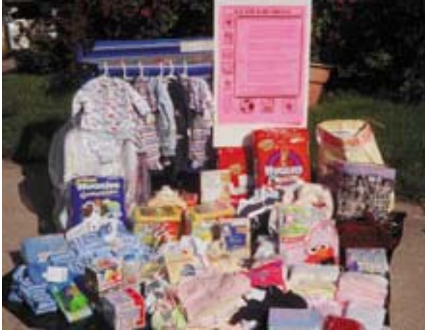
The Women's Center in Chicago received more than 100 items, including a crib, from Brownson Council 1030 in Chicago.

The tour was partly sponsored by North American Martyrs Council 4338 in Niles.